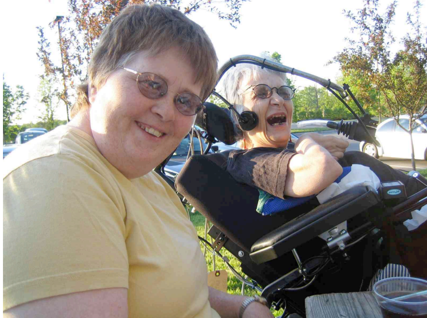
Photograph by Alice Elliott